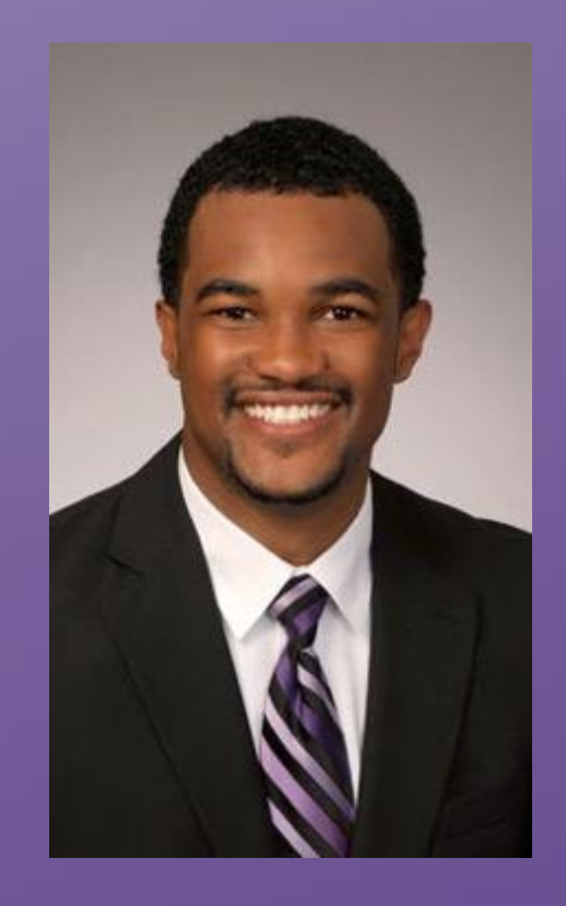
Born in Columbia, SC

Summer of 2012 conducted research in Uganda on health needs, clean water practices and health literacy. Enjoys performing as a tenor, music composition and tennis.